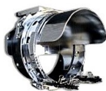
1 x hoop station per machine for easy snap in & snap out preparation of caps