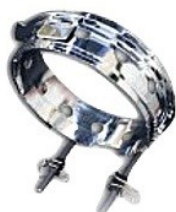
2 x cap rings per head that snap into cap station for preparation and then embroidery