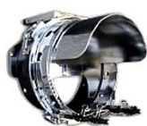
1 x hoop station per machine for easy snap in & snap out preparation of caps