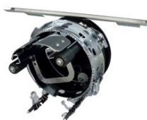
1 x cap driver per head that snaps in to embroidery machine's bracket holder for hoops