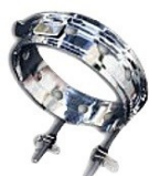
2 x cap rings per head that snap into cap station for preparation and then embroidery