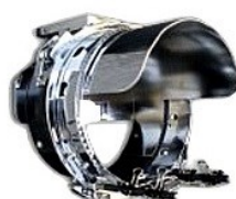
1 x hoop station per machine for easy snap in & snap out preparation of caps