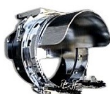
1 x hoop station per machine for easy snap in & snap out preparation of caps