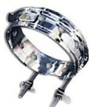
2 x cap rings per head that snap into cap station for preparation and then embroidery