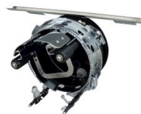
1 x cap driver per head that snaps in to embroidery machine's bracket holder for hoops