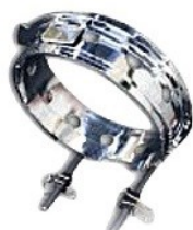
2 x cap rings per head that snap into cap station for preparation and then embroidery